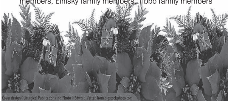
Cover design © Liturgical Publications Inc.